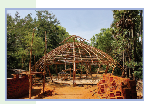
Work on the communal meeting place begins

n 2015 another donation from FWE came in, this time to construct a kitchencum-meeting space, and funds from an Aurovilian facilitated the building of a compost toilet and shower. Plans, which had first been made together