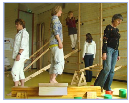
Awareness Through the Body for adults

For more information about these workshops visit: www.awarenessthroughthebody.wordpress.com